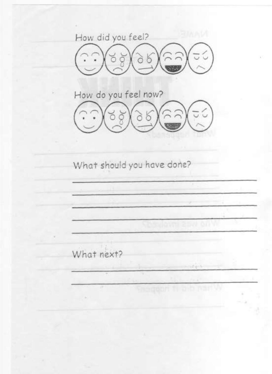
Appendix 2 KS 2 Think Sheet